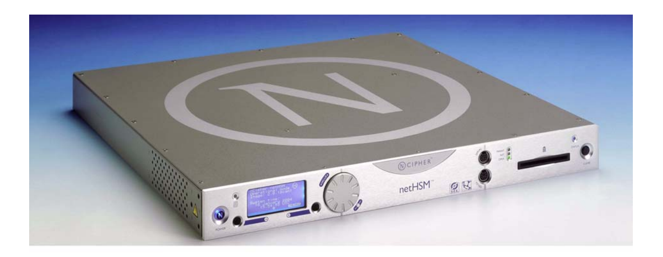
The following figure shows the module mounted inside the NetHSM