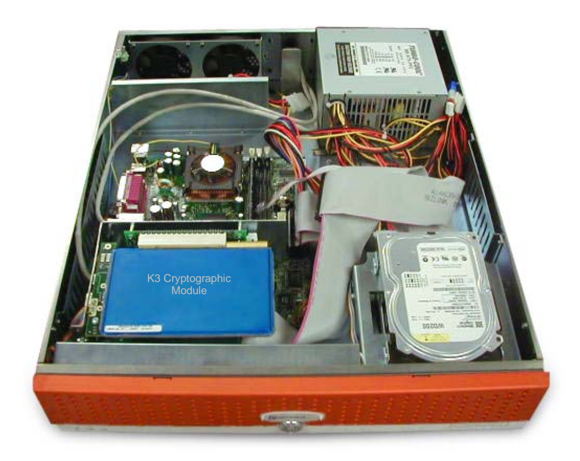
Figure 2-2 K3 Cryptographic Module Inside Luna SA

The module may be explicitly configured to operate in either FIPS Level 2 or FIPS Level 3, or in a non-FIPS mode of operation. Configuration in either FIPS mode enforces the use of FIPS-approved algorithms only. Configuration in FIPS Level 3 mode also enforces the use of trusted path authentication.