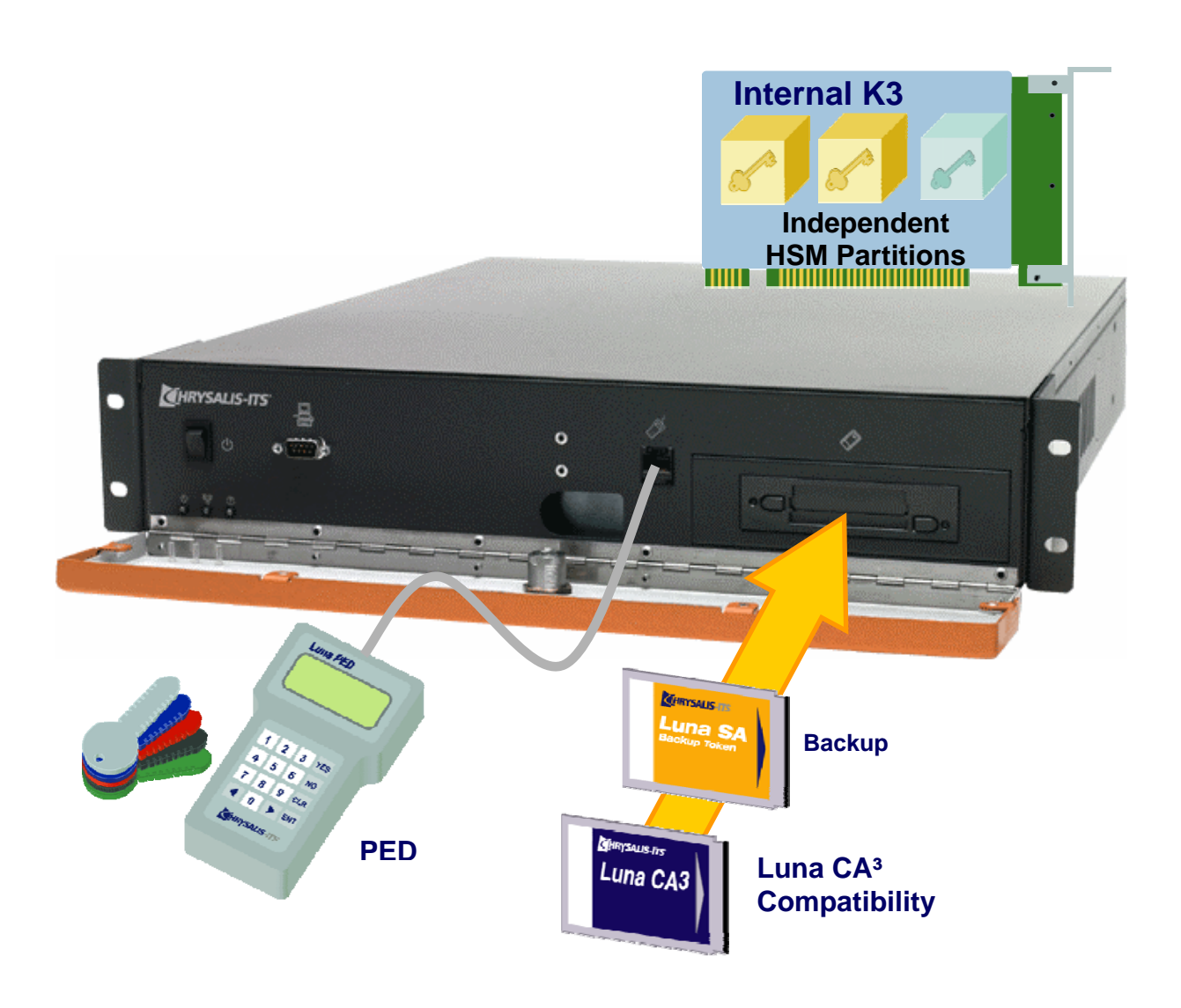
Figure 2-1 Luna® SA HSM Server System

The K3 cryptographic engine is a multi-chip embedded hardware cryptographic module in the form of a PCI card that resides within a customized general-purpose computing appliance. It is contained in its own secure enclosure that provides physical resistance to tampering and zeroization in the event the enclosure is opened. The cryptographic boundary of the module is defined to encompass all components inside the secure enclosure on the PCI card. Figure 2-1 illustrates the use of the K3 cryptographic module and associated peripherals, such as the Luna® PED and the backup token, within the Luna® SA HSM Server system (an example of a host appliance using the K3 cryptographic module). Figure 2-2 shows the K3 cryptographic module as it is installed in the Luna SA HSM Server.