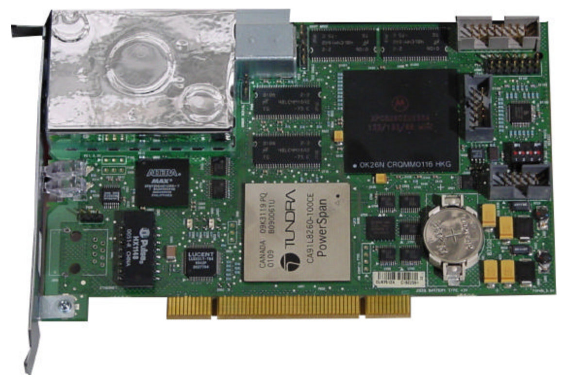
Figure 1 Key Management Facility Crypto Card

The KMF CC provides encryption and decryption services for secure key management and Over-the-Air-Rekeying (OTAR) for Motorola's Key Management Facility (KMF). The KMF and KMF CC combine to provide these cryptographic services for Motorola's APCO-25 compliant Astro <sup>TM</sup> radio systems.