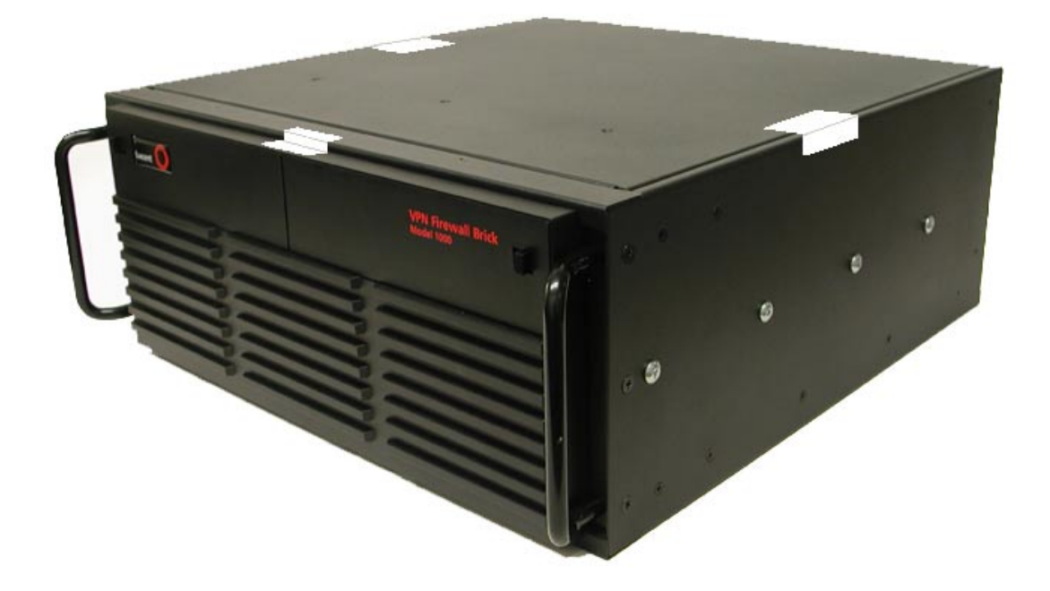
Figure 2 – Tamper evidence label placement on front panel/top

the enclosure and the other half covers the side of the module. Any attempt to remove the enclosure will leave tamper evidence.