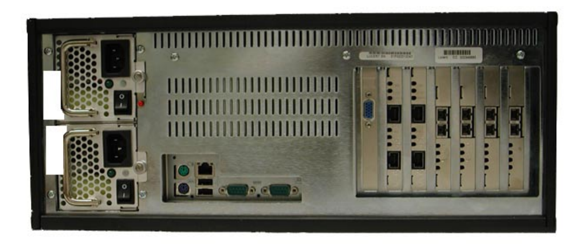
Figure 3 -- Tamper evidence label placement on back panel

The placement of the labels should be consistent with the instructions and the images above. The tamper evidence seals have a special adhesive backing to adhere to the module's painted surface. Removing the power panel, network interface panel, bottom cover or top cover will damage the tamper evidence seals. Tamper evidence labels can be inspected for signs of tampering, which include the following: curled corners, bubbling, and rips.