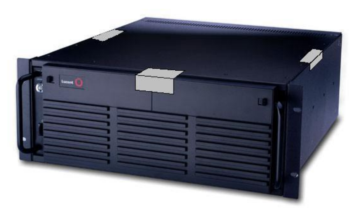
Figure 2 – Tamper evidence label placement on front panel/top

The placement of the labels should be consistent with the instructions and the images above. The tamper evidence seals have a special adhesive backing to adhere to the module's painted surface. Removing the power panel, network interface panel, bottom cover or top cover will damage the tamper evidence seals. Tamper evidence labels can be inspected for signs of tampering, which include the following: curled corners, bubbling, and rips.