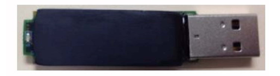
Figure 1 SPYRUS MDTU-P384 Encryption Module (Topside)