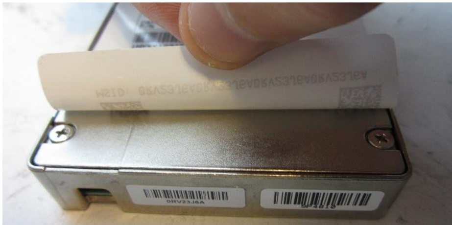
Figure 3 - Lift top label