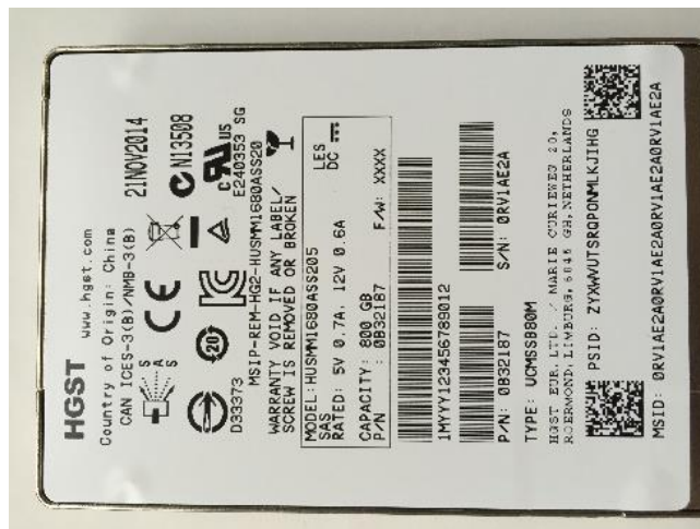
Figure 2 Large Tamper-Evident Label on Top Surface

The Cryptographic Module does not make claims in the Physical Security area beyond FIPS 140-2 Security Level 2.