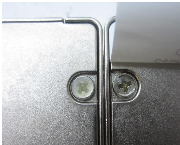
Figure 4 - Left side shows tamper. Right side shows no tamper.