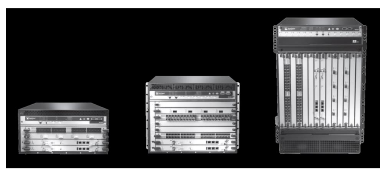
Figure 1 – Physical Cryptographic Boundary (Left: MX240, Center: MX480, Right MX960)

The image below depicts the physical boundary of the modules, including the Routing Engine, MS-MPC, and SCB.