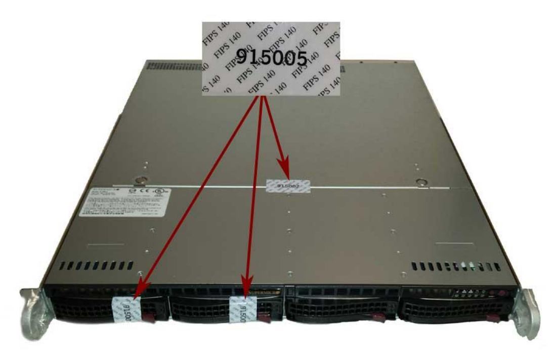
Figure 2 – Location of Tamper-Evident Seals