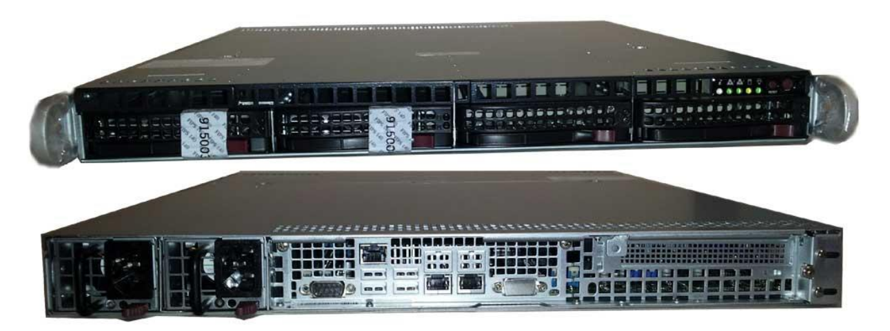
Figure 1 – Hardware Module Cryptographic Boundary (front bezel removed)