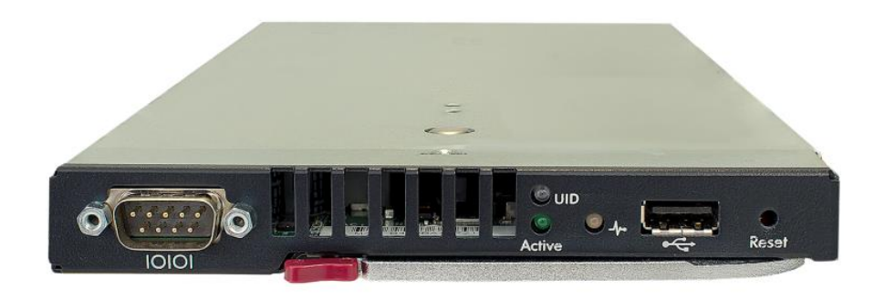
Figure 3 - BladeSystem c7000 Onboard Administrator with KVM