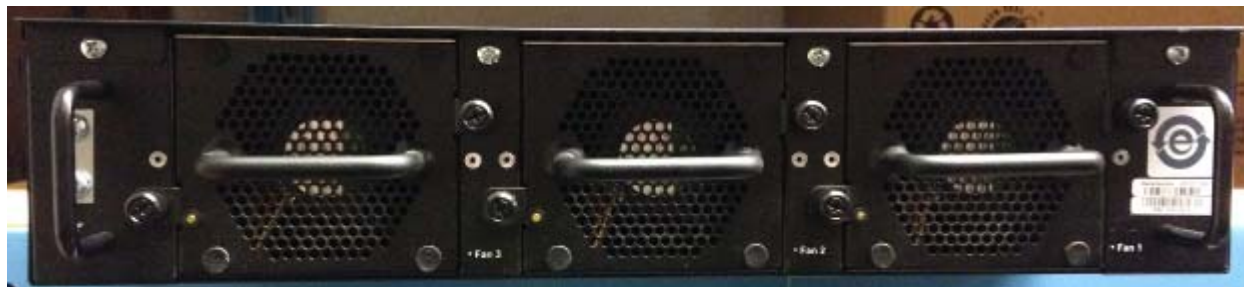
Figure 3 - Rear Panel of M-8000 S (No Ports)