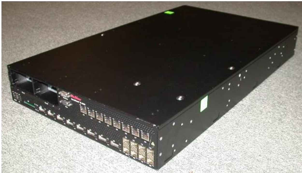
Figure 1 – Image of the Cryptographic Module (with Power Supply Trays Unpopulated)

Figure 1 shows the module and its cryptographic boundary.