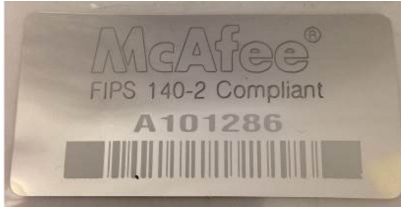
Figure 5 - Tamper Label