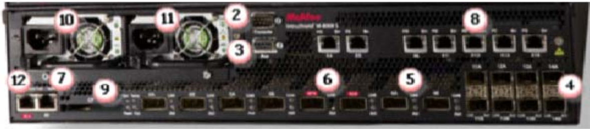
Figure 2 - M 8000 S Front Panel (with Power Supply Trays Populated)

Table 2 provides the cryptographic module's ports and interfaces.