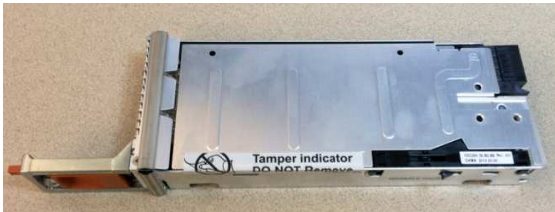
Figure 1 – Physical Boundary (Top)

The module is EMC's VMAX 6 Gb/s SAS I/O Module with Encryption, Part Number 303-161-101B-05 running firmware version 2.13.39.00. It is classified as a multi-chip embedded hardware cryptographic module, and the physical cryptographic boundary is defined as the module board, controller, flash memory, and interfaces as depicted in Figure 2 – Physical Boundary below.