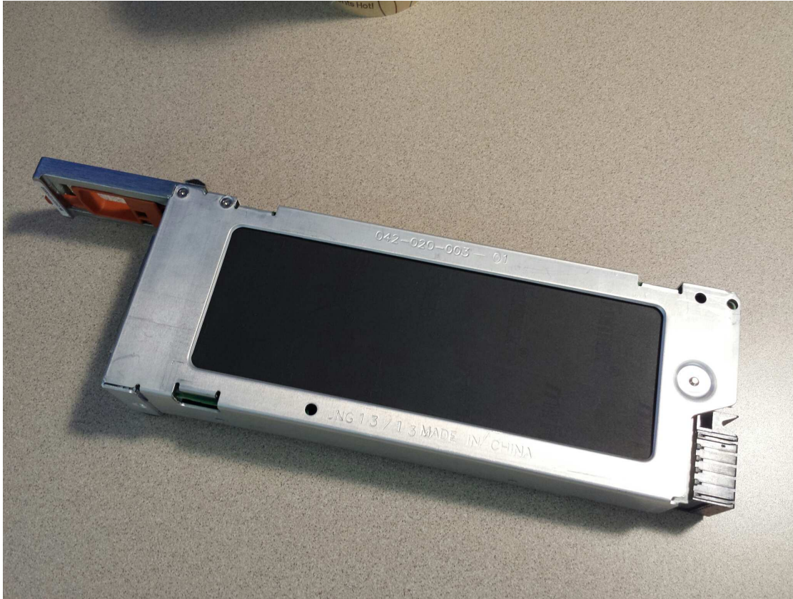
Figure 2 – Physical Boundary (Bottom)

No components are excluded from validation. The module encrypts and decrypts data using only a FIPS-approved mode of operation. It does not have any functional non-approved modes or bypass capability.