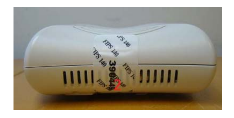
Figure 18 - Aruba AP-105 TEL placement right view