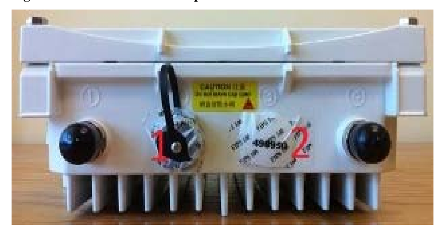
Figure 22 - Aruba AP-175 TEL placement back view