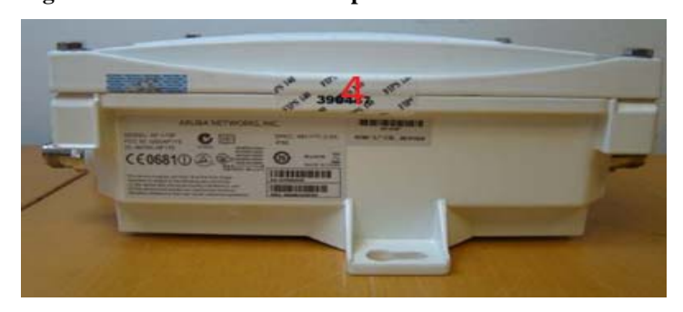
Figure 24 - Aruba AP-175 TEL placement right view