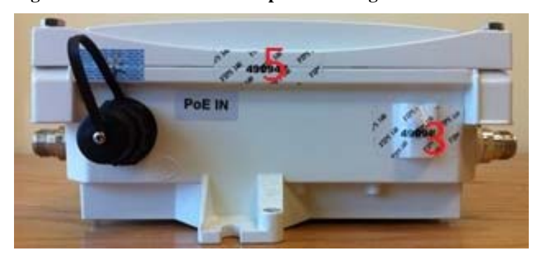
Figure 25 - Aruba AP-175 TEL placement top view