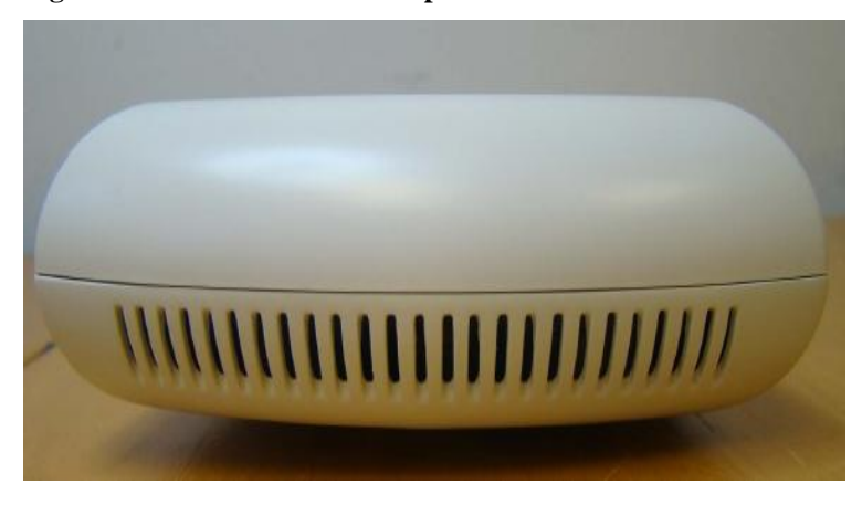
Figure 17 - Aruba AP-105 TEL placement left view