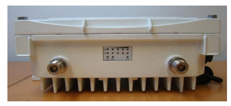
Figure 23 - Aruba AP-175 TEL placement left view