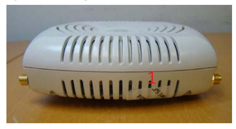
Figure 2 - Aruba AP-92 TEL placement left view