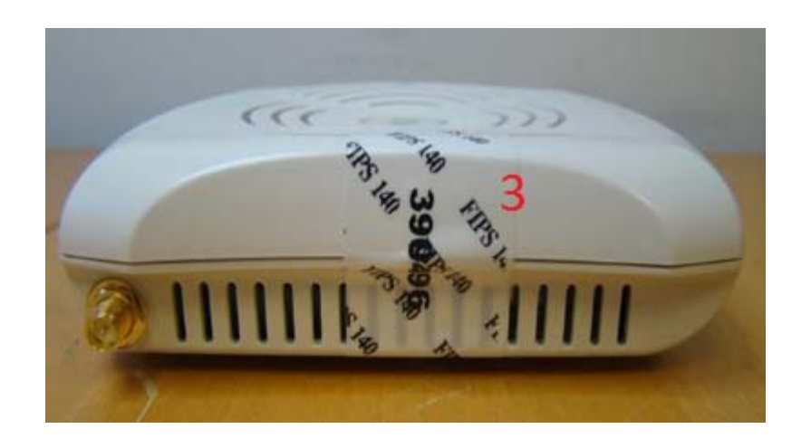
Figure 3 - Aruba AP-92 TEL placement right view