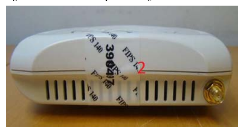
Figure 4 - Aruba AP-92 TEL placement top view