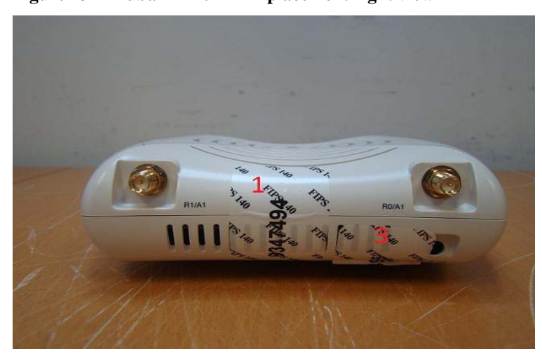
Figure 14 - Aruba AP-104 TEL placement top view