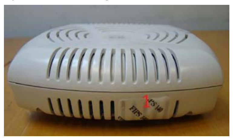
Figure 6 - Aruba AP-93 TEL placement front view

Following is the TEL placement for the AP-93: