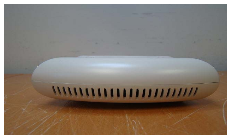
Figure 12 - Aruba AP-104 TEL placement left view