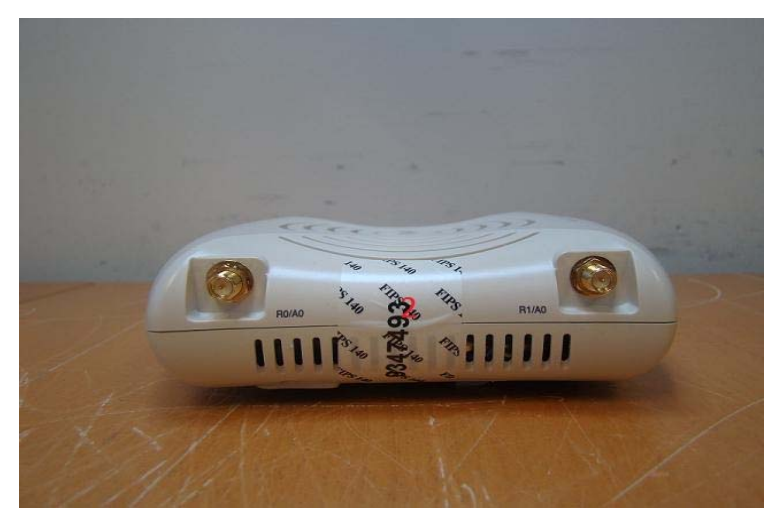
Figure 13 - Aruba AP-104 TEL placement right view