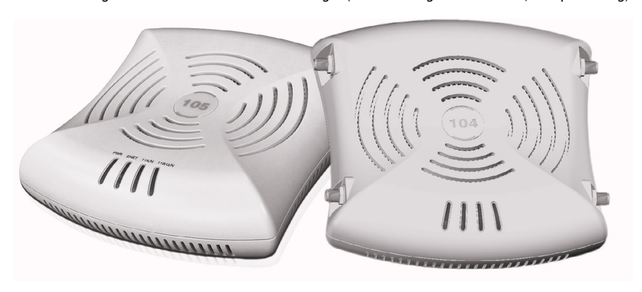
Aruba Networks AP-104 and AP-105 Product Images:

Dell Networking W-AP104 and W-AP105 Product Images (no rebranding of the exterior, except labeling):