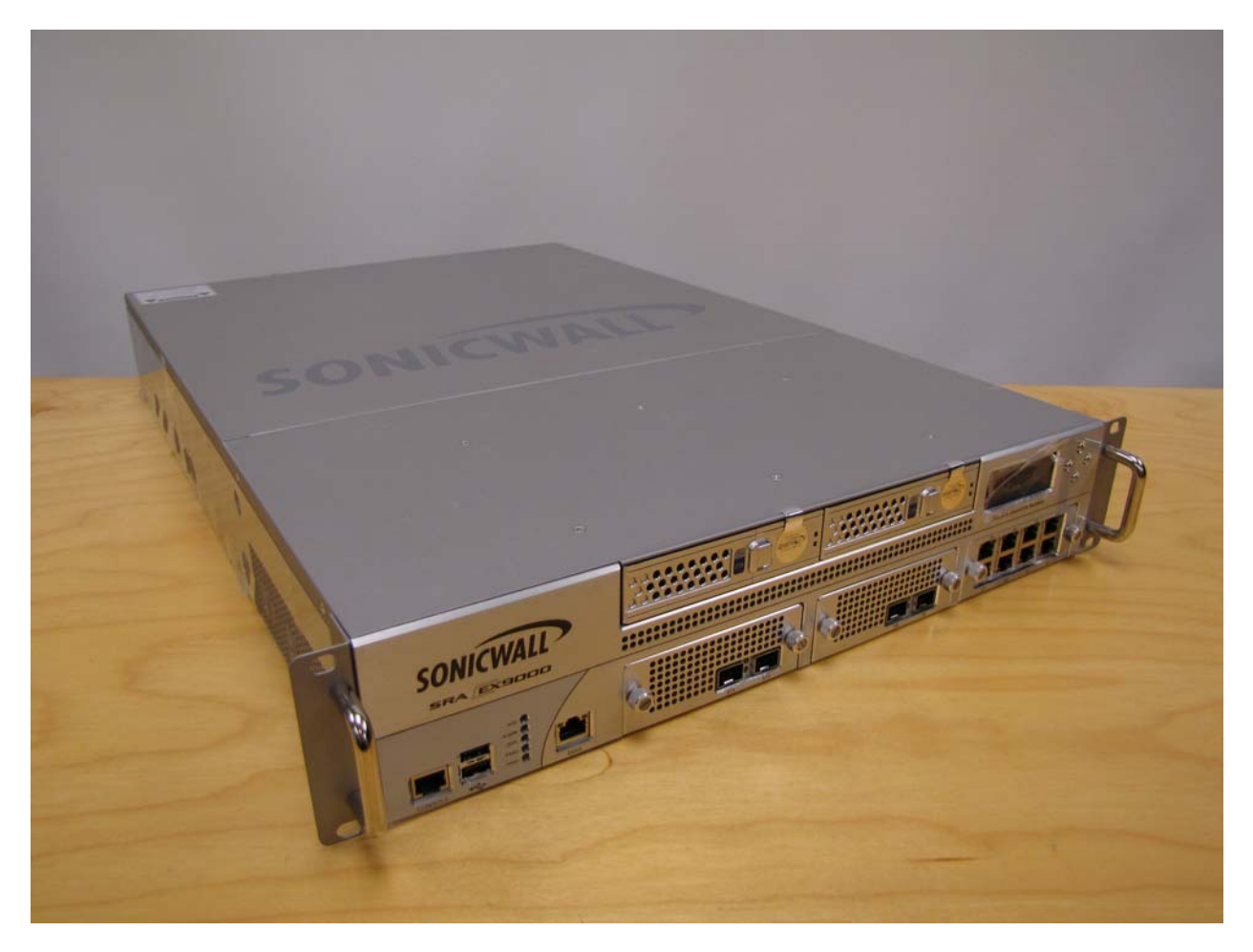
Figure 1 – Dell SonicWALL SRA EX9000- Front Side

The Dell SonicWALL SRA EX9000 (HW P/N 101-500352-59 Rev A, FW Version SRA 10.7.1) is a multi-chip standalone cryptographic module enclosed in a hard, opaque, commercial grade metal case. The primary purpose of this module is to provide secure remote access to internal resources via the Internet Protocol (IP). The module provides network interfaces for data input and output. The appliance encryption technology uses Suite B algorithms. Suite B algorithms are approved by the U.S. government for protecting both Unclassified and Classified data.