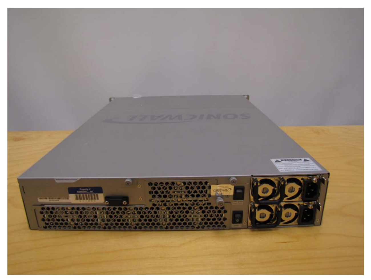
Figure 2 Dell SonicWALL SRA EX9000- Back Side