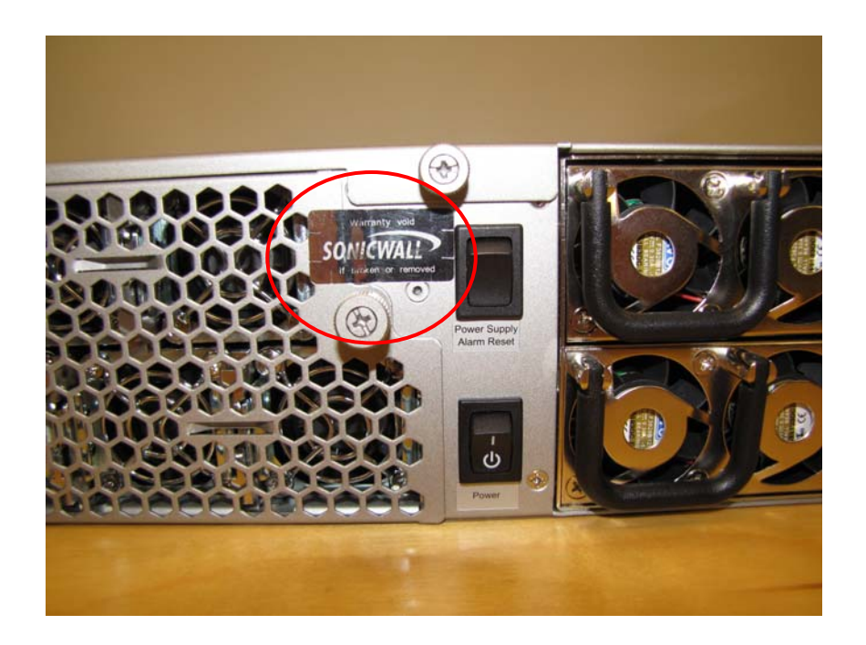
Figure 5 Tamper Seal #5 – Rear Fans