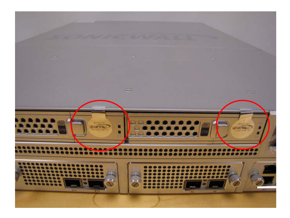
Figure 6 Type 2 Tamper Seals #6 and #7 – Front Drive Bays