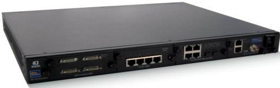
Figure 1 PacketAssure iQ1000, IOM Side

The iQ1000 is modular, with a basic system configuration consisting of the chassis, power supply, Packet Switching Module (PSM), System Interface Module (SIM), Fan module and Filter Module. The PSM provides all packet switching, service delivery