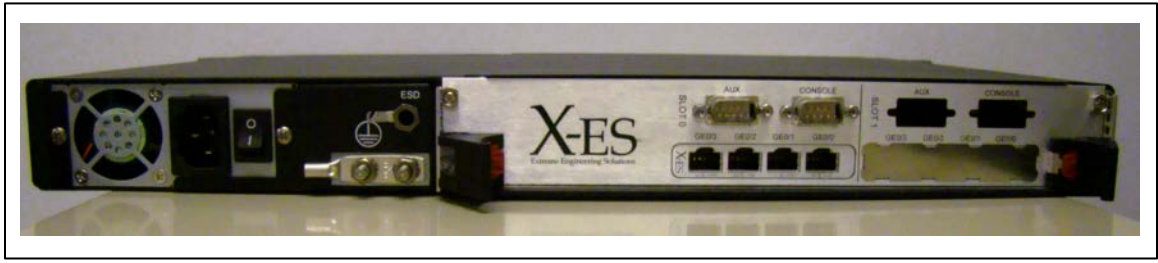
Figure 2: X-ES XPedite5205 (with Cisco IOS) Testing Enclosure

For test purposes, the module was enclosed in the following development enclosure: