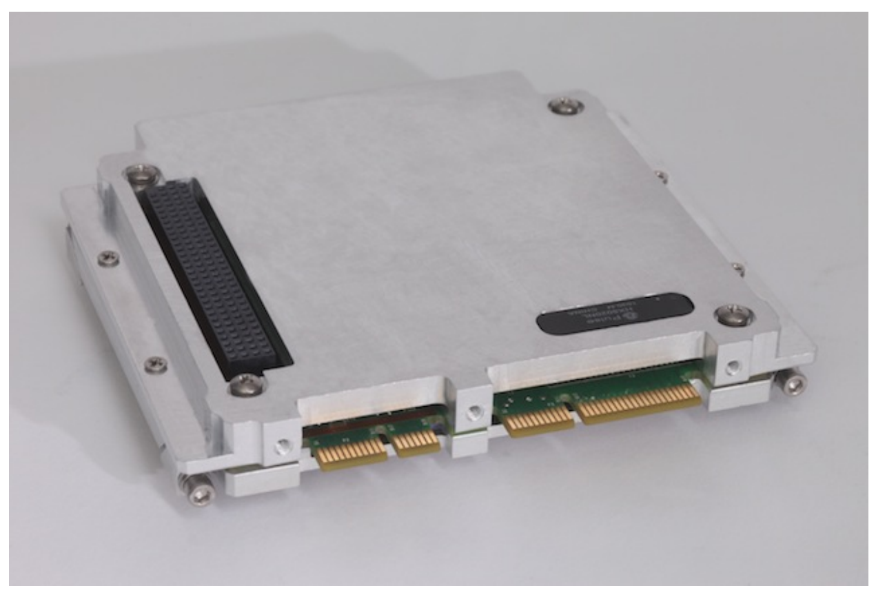
Figure 2: Cisco 5915 Conduction cooled, side view

The LED signals are located on the edge fingers. The card, itself, does not contain any LEDs. A system integrator is responsible for connecting the LED signals to actual LEDs: