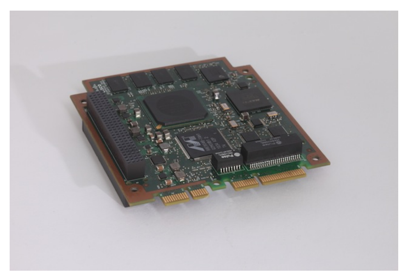
Figure 1: Cisco 5915 Air cooled side view

The interface for the router is located on the PCI fingers as shown in Figures 1 and Figure 2, respectively.