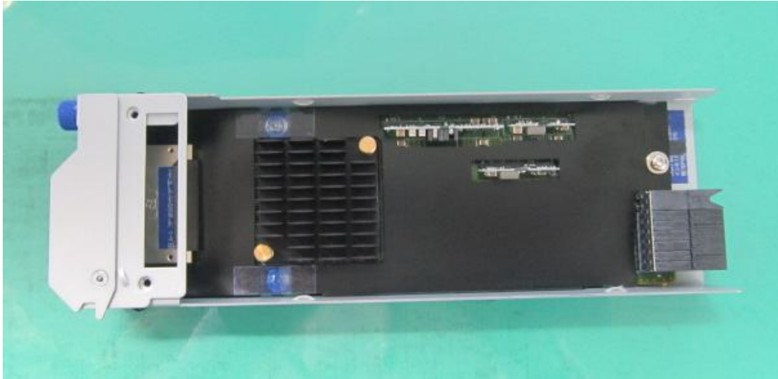
Figure 1 – Module

The physical form of the Module is depicted in Figure 1; the physical boundary of the cryptographic module is the same as the physical boundary depicted in Figure 1. Major components of the module are module board, micro processor, non-volatile memories and interfaces. The Module relies on Hitachi storage as input/output devices.