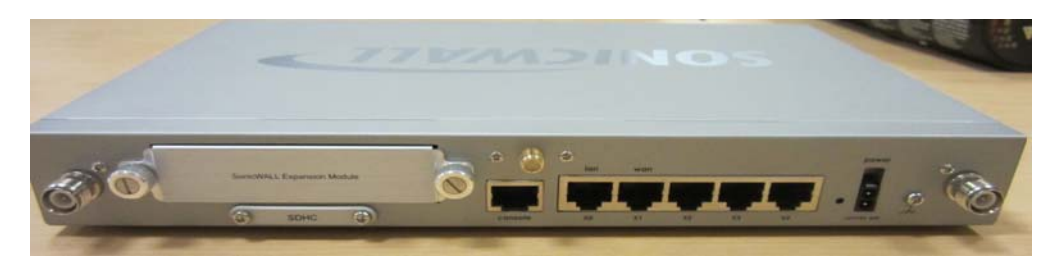
Figure 4 – NSA 250MW Rear