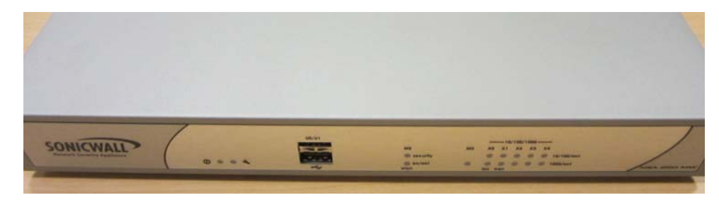
Figure 3 – NSA 250MW Front

The cryptographic boundary includes the entire device.