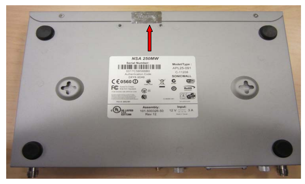
Figure 7 – NSA 250M/MW Tamper-Evident Seal