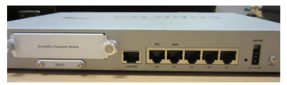
Figure 6 – NSA 250M Rear

The chassis is protected with one (1) tamper-evident seal, which is applied during manufacturing. The physical security of the module is intact if there is no evidence of tampering with the seal. The location of the tamper-evident seal is indicated by the arrow in Figure 1.