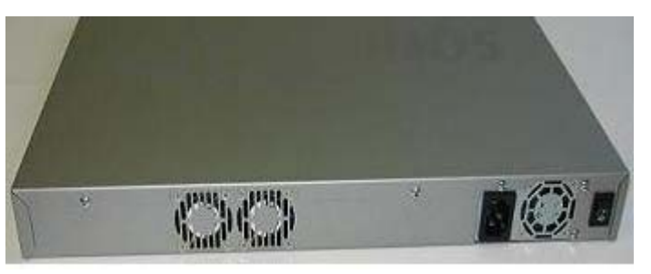
Figure 4: NSA 4500 Rear