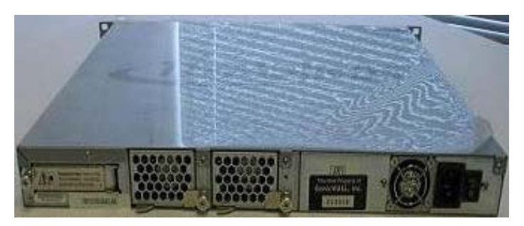
Figure 6: NSA E5500 Rear

The tamper-evident seals on each module are applied by Dell SonicWALL during manufacturing.