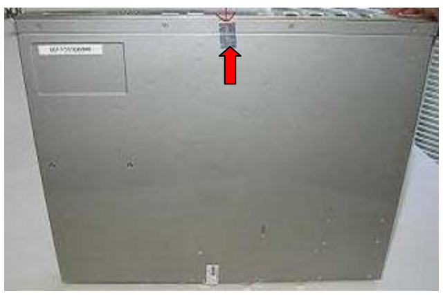
Figure 8: NSA E5500 Tamper Evident Seal