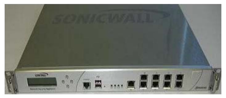
Figure 5: NSA E5500 Front