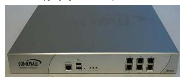
Figure 3: NSA 4500 Front

The cryptographic boundary includes the entire device.