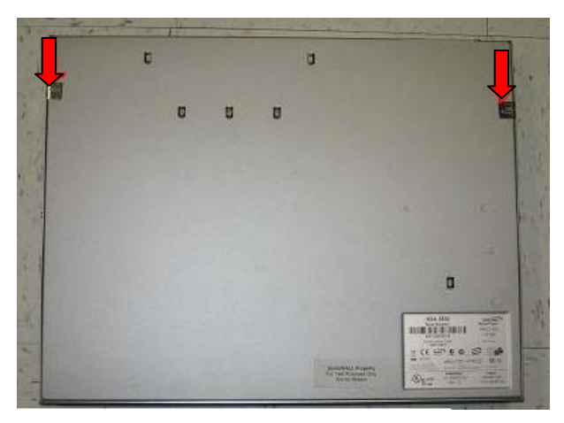
Figure 9: NSA 4500 Tamper Evident Seals

The chassis for the NSA 4500 is sealed with two tamper-evident seals. The physical security of the module is intact if there is no evidence of tampering with the seals. The locations of the tamper-evident seals for the NSA 4500 are indicated by the red arrows in Figure 7 below: