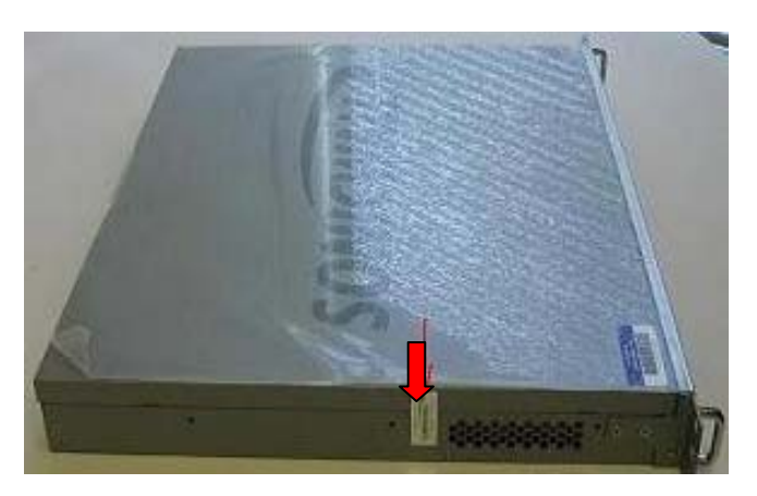
Figure 7: NSA E5500 Tamper Evident Seal

The chassis for the NSA E5500 cryptographic module is sealed with two tamper-evident seals. The physical security of the module is intact if there is no evidence of tampering with the seals. The locations of the tamper-evident seals for the NSA E5500 cryptographic module are indicated by the red arrows in Figures 5 and 6 below: