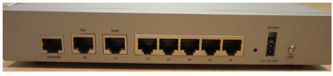
Figure 2 – NSA 220/220W Back

The chassis is sealed with one tamper evident seal, which is applied during manufacturing. The physical security of the module is intact if there is no evidence of tampering with the seal. The location of the tamper evident seal is indicated by the red arrow in Figure 4 below: