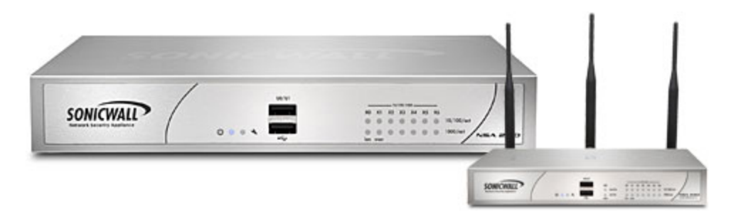
Figure 5 – NSA 220 Front (at Left) and NSA 220W Front (at Right)