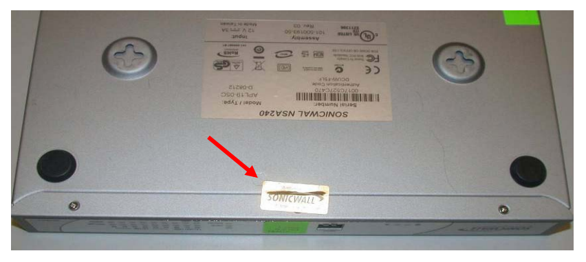
Figure 6 – Tamper Seal Location (220/220W/240 - Bottom)

The chassis is sealed with one tamper evident seal, which is applied during manufacturing. The physical security of the module is intact if there is no evidence of tampering with the seal. The location of the tamper evident seal is indicated by the red arrow in Figure 4 below: