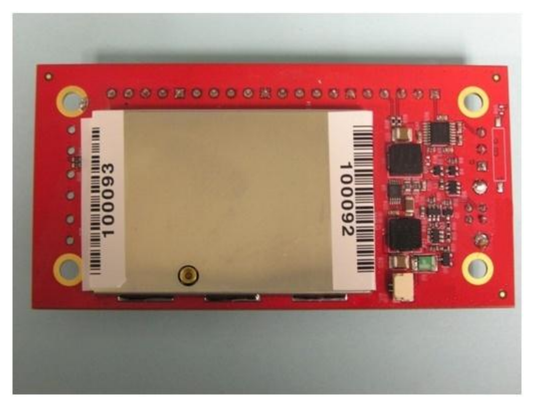
Figure 1 – 3e-543 AirGuard iField Wireless Sensor Cryptographic Module

The figure below shows the 3e-543 Secure Access Point Cryptographic Module.