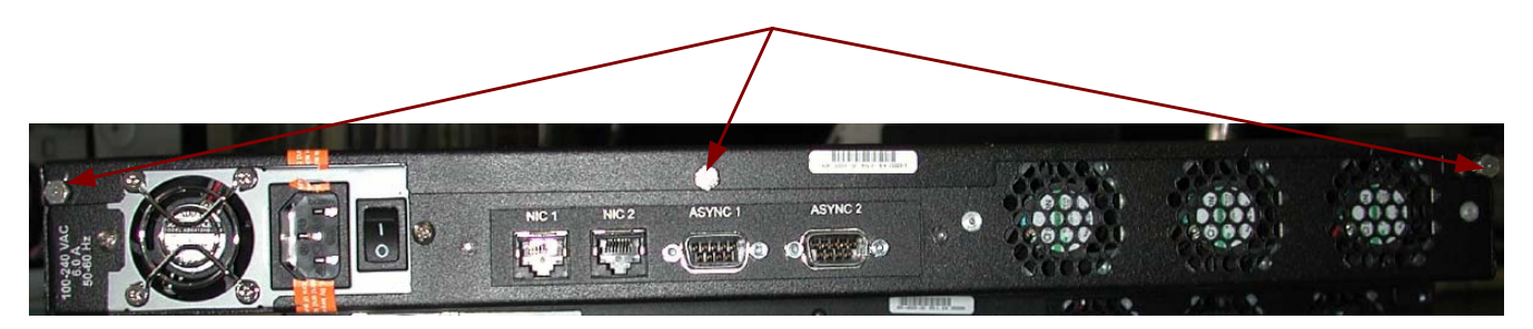
Figure 8-1. Break-away crews at rear of appliance

The appliance is contained in a hard metal enclosure with double louvers and baffles to prevent probing. The enclosure is sealed using break-away screws and tamper-evident seals that are applied at manufacturing to prevent easy removal of the enclosure's lid and to provide tamper evidence in the event the lid is forced off in some way.