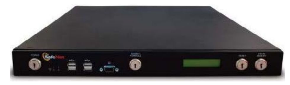
Figure 2-1. SafeNet LUNA EFT

The loader firmware is implemented as a 32-bit protected mode Intel executable and runs as the only application on a specially cut-down Fedora Core 3 (FC3) Operating System (O/S). The FC3 system launches the loader firmware and provides disk and memory management services and communication services to the loader firmware.