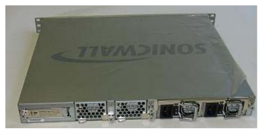
Figure 6 - NSA E7500 Rear