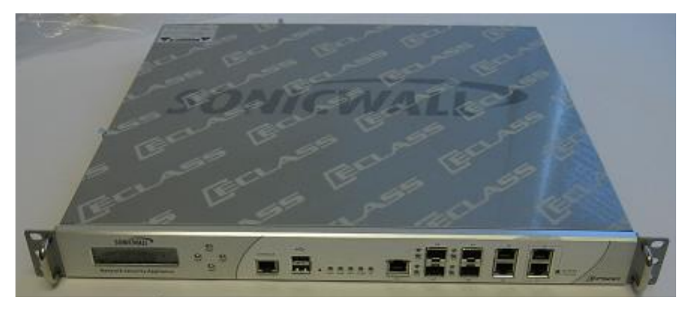
Figure 5 - NSA E7500 Front