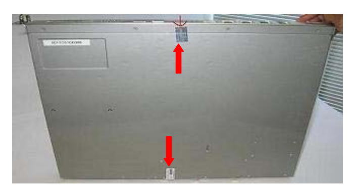
Figure 3 - Tamper Evident Seal

The chassis is sealed with three tamper-evident seals, which are applied during manufacturing. The physical security of the module is intact if there is no evidence of tampering with the seals. The locations of the tamper-evident seals are indicated by the red arrows in Figure 3 and Figure 4 below: