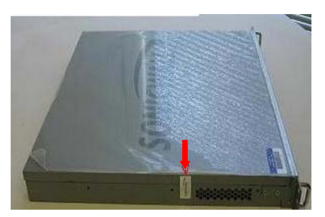
Figure 4 - Tamper Evident Seal