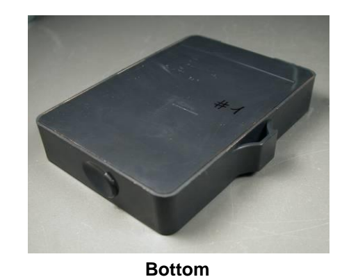
Figure 1 - Postal Security Device module (PSD)

The PSD (Figure 1) consists of a cryptographic sub function and postal services sub function sharing common hardware that is contained on a printed circuit board and enclosed within a hard opaque plastic enclosure encapsulating the epoxy potted module which is wrapped in a special tamper detection envelope with a tamper response mechanism that zeroizes all plaintext CSPs. This enclosure constitutes the cryptographic physical boundary.