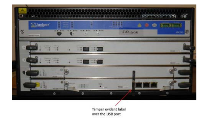
Figure 4 – MX240 Label Placement