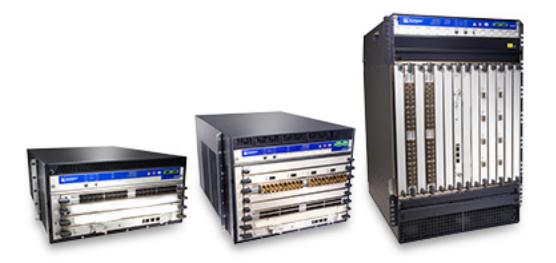
Figure 1 - Cryptographic Module Images