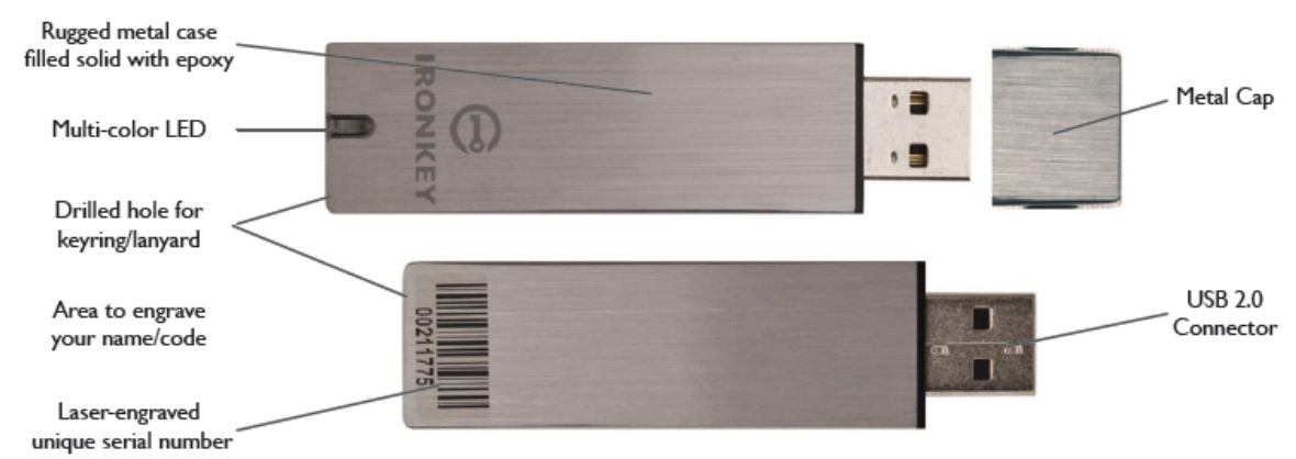
Figure 1 – Image of the Cryptographic Module (S250)

The cryptographic boundary is defined as being the outer perimeter of the metallic enclosure and is depicted below.