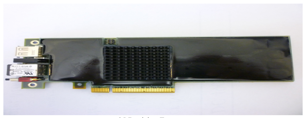
-05 Revision Front