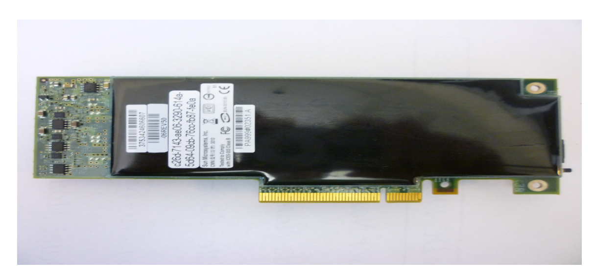
Revision -06 Back