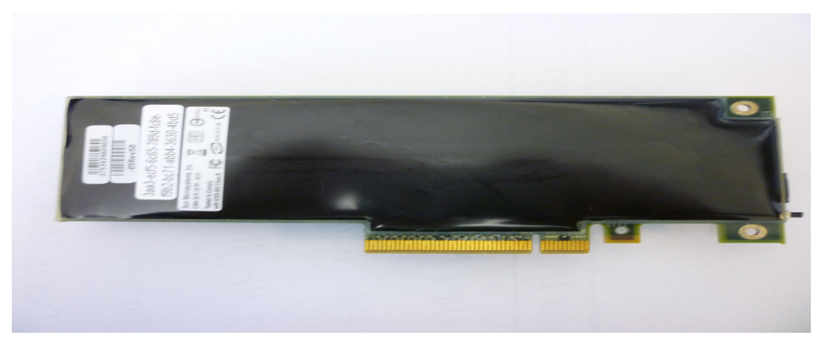
-05 Revision Back