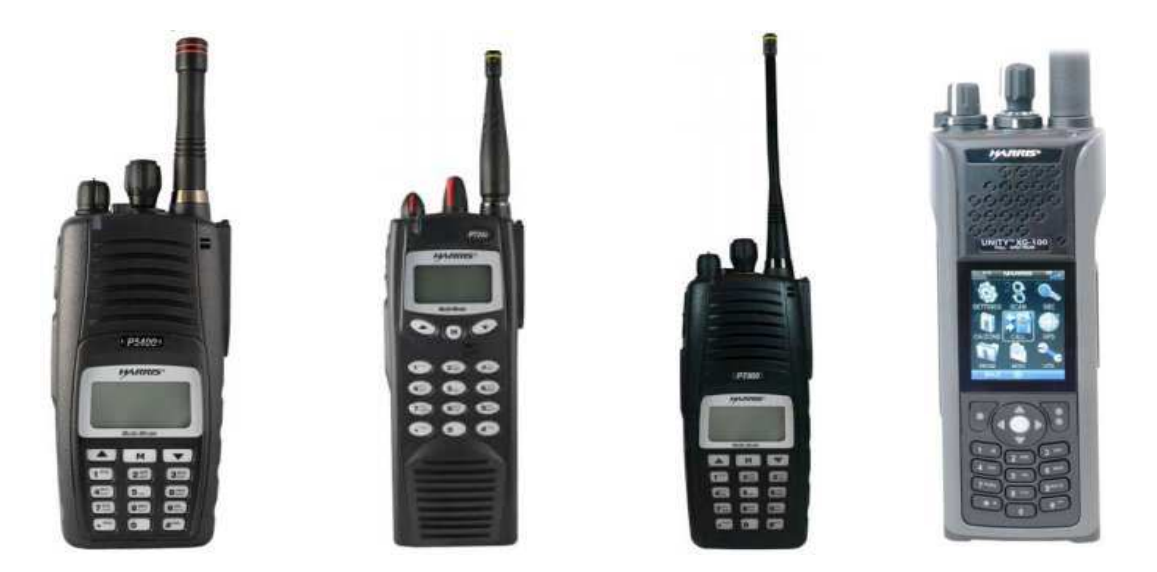
Figure I - HALM Portable Terminals (Left to Right: 5400, 7200, 7300, and Unity)

Harris is a leading supplier of systems and equipment for public safety, federal, utility, commercial, and transportation markets. Their products range from the most advanced IP<sup>1</sup> voice and data networks, to industry-leading multiband/multimode radios, and even public safety-grade broadband video and data solutions. Their comprehensive line of software-defined radio products and systems support the critical missions of countless public and private agencies, federal and state agencies, and government, defense, and peacekeeping organizations throughout the world. This Security Policy documents the security features of the Harris AES Software Load Module (HALM) incorporated into the Harris 5300 (Mobile 800Mhz only), 5400 (Portable only), 5500 (Portable only), 7200, 7300, Unity, XG-25P, XG-25M, XG-75 UHF-L, XG-75 VHF, XG-75 (800 MHz) and other terminal products, which are single and multi-band, multi-mode radios that deliver end-to-end encrypted digital voice and data communications, and are Project 25 Phase 2 upgradable<sup>2</sup>. Figure 1 and Figure 2 display some of the many radio terminals the Harris AES Software Load Module is incorporated into.