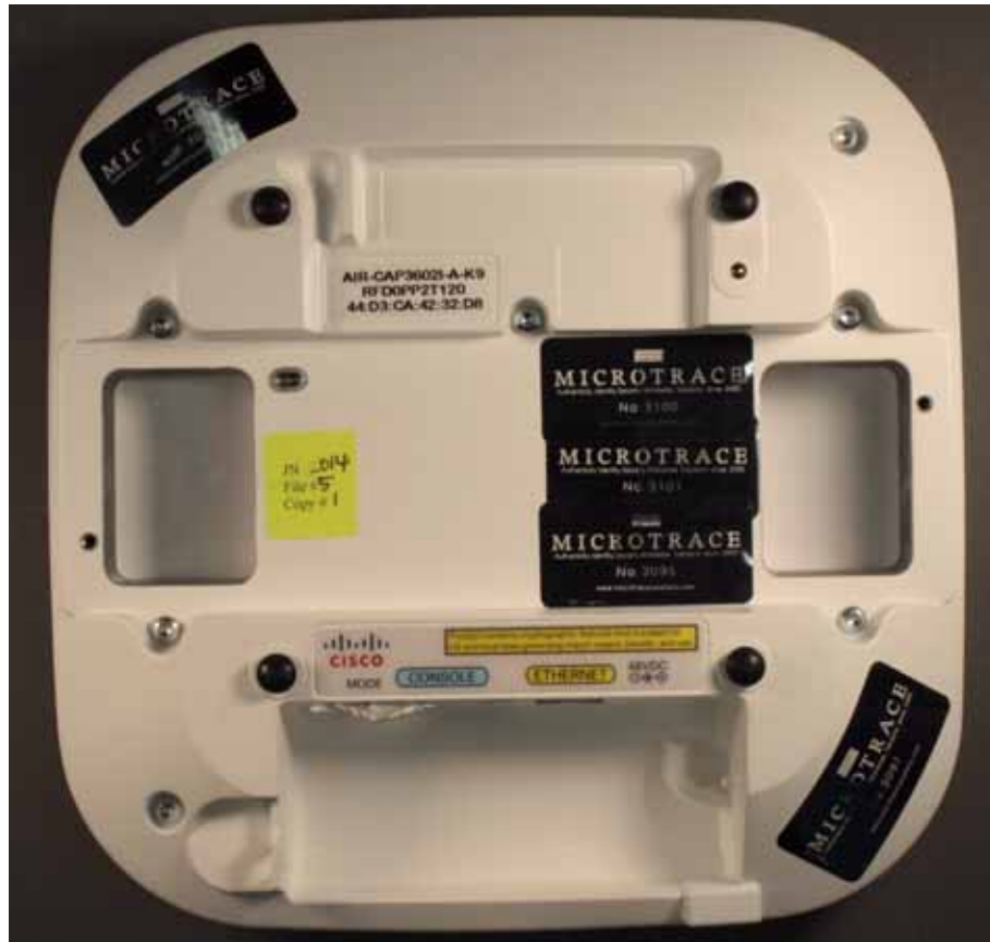
Figure 4 Seals Covering Screws On Module Enclosure and Module Connector Slot

Two (2) seals are placed over the specified two (2) screws on corners of the plastic module enclosure (see Figure 4 ) to prevent the screws from being removed without evidence of tamper and ensure that the enclosures are opaque. Three (3) seals are placed over the module connector slot to prevent access to the module.