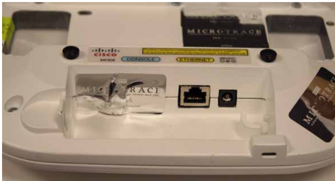
Figure 3 Seal Covering Console Port and Mode Button

The seal placement is identical for the CAP3602E and CAP3602I (FIPS kit AIR-AP-FIPSKIT=, version B0): one (1) seal is placed underneath the bottom metal cover to prevent access to the Console port (see Figure 3 ). The FIPS kit also includes a metal guard, that goes over the Mode button. The metal guard physically prevents the Mode button from being pressed. The seal also covers the metal guard.