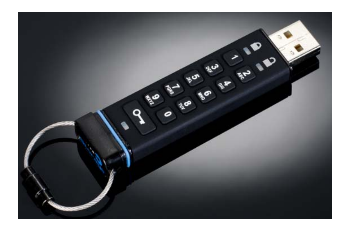
Figure 1 – iStorage datashur cryptographic boundary showing input buttons and status LEDs