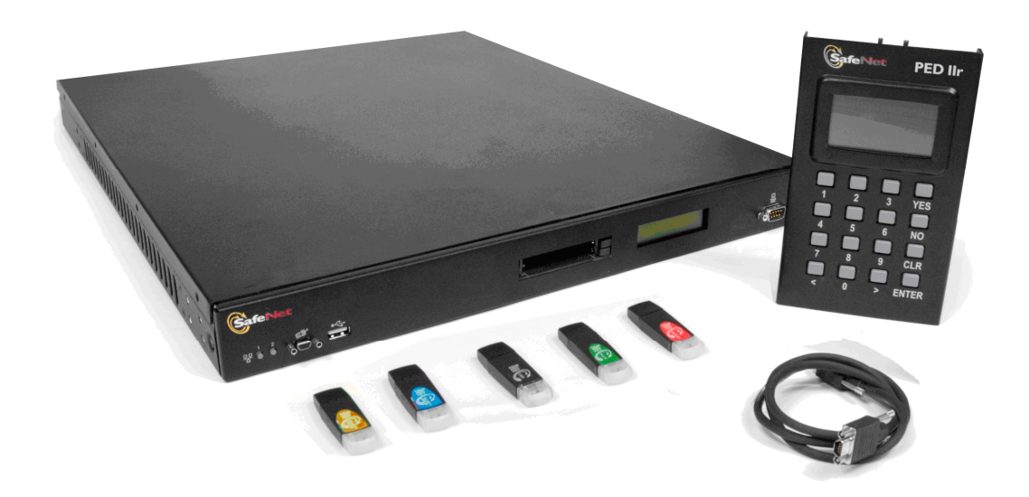
Figure 2-2. Luna SA with PED and iKeys