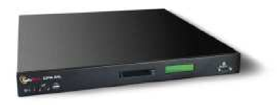
Figure 2-4. Luna XML with Luna PCI Module Installed