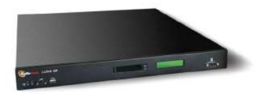
Figure 2-3. Luna SP with Luna PCI Module Installed