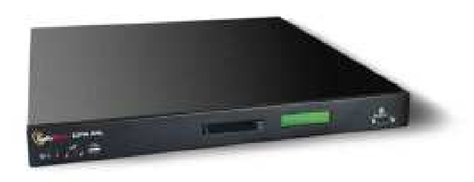
Figure 2-4. Luna XML with Luna PCI Module Installed