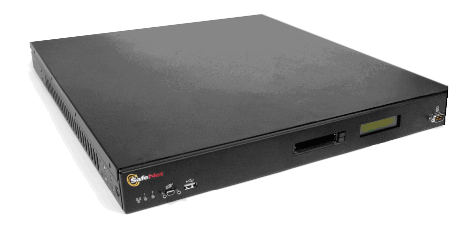
Figure 2-2. Luna SA with Luna PCI Module Installed