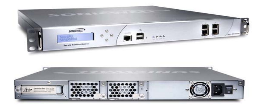
Figure 1 – Images of the Cryptographic Modules

The SonicWALL SRA EX6000 (HW P/N 101-500210-62 Rev A, FW Version SRA 10.6.1) and SRA EX7000 (HW P/N 101-500188-62 Rev A, FW Version SRA 10.6.1) are multi-chip standalone cryptographic modules enclosed in a hard, opaque, commercial grade metal case. The primary purpose of these modules is to provide secure remote access to internal resources via the Internet Protocol (IP). The modules provide network interfaces for data input and output.