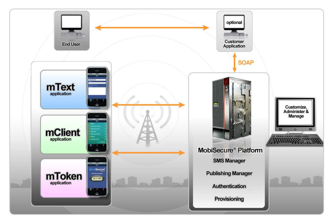
Figure I – Diversinet MobiSecure® Platform

The Diversinet Java Crypto Module is the FIPS validated module that provides cryptographic functionality for the MobiSecure® Platform. The Diversinet Java Crypto Module is validated at the following FIPS 140-2 Section levels: