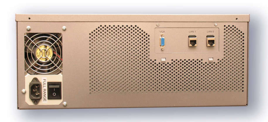
Figure 2 – Front and Rear Interfaces

For FIPS 140-2 purposes, both network ports are treated the same. Through the network ports either an encrypted and RSA based authenticated sessions are permitted or a user ID/password authenticated sessions are permitted over either ports when operating in a FIPS 140-2 compliant manner. In a non-FIPS 140-2 compliant manner, the module could be configured so that traffic over the secure Ethernet port was plaintext while traffic over the unsecure network was encrypted and authenticated or user-ID/password authenticated.