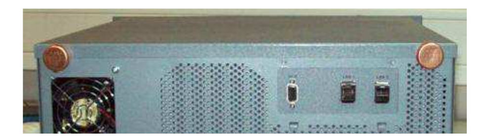
Figure 1 – Tamper Evident cans

The Tamper Evident cans are shown in Figure 1.