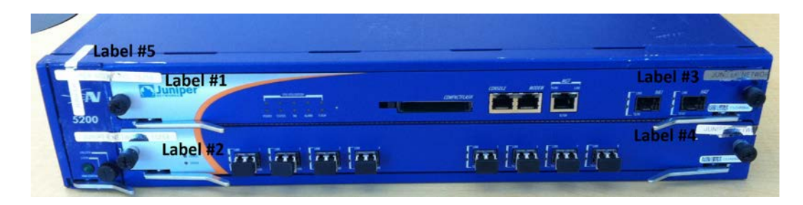
Fig. 3: Front of NetScreen-5200

• If a seal must be removed, the surface should be prepared as described above prior to the application of a replacement seal.