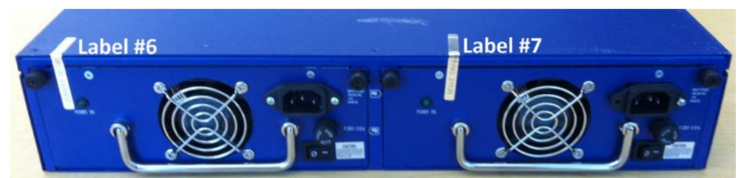
Fig. 4: Rear of NetScreen-5200