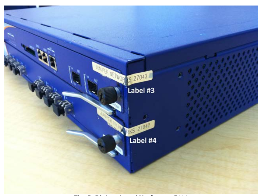
Fig. 5: Right edge of NetScreen-5200