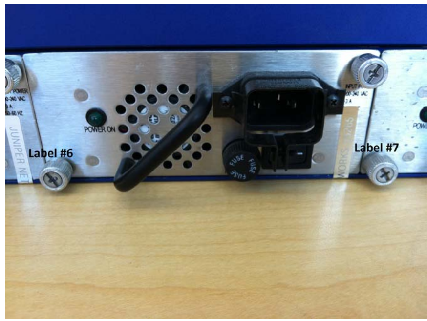
Figure 11: Detail of power supplies on the NetScreen-5400