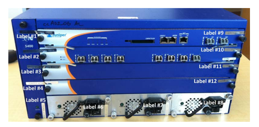
Figure 8: Front of the NetScreen-5400

The removable cover on the NS5200 is a single piece covering the top of the unit and is fastened to the chassis by three retaining screws at the rear. Figure 7 depicts the device with the tamper seals removed and the cover partially removed. Please note that there are no user serviceable components inside the device.