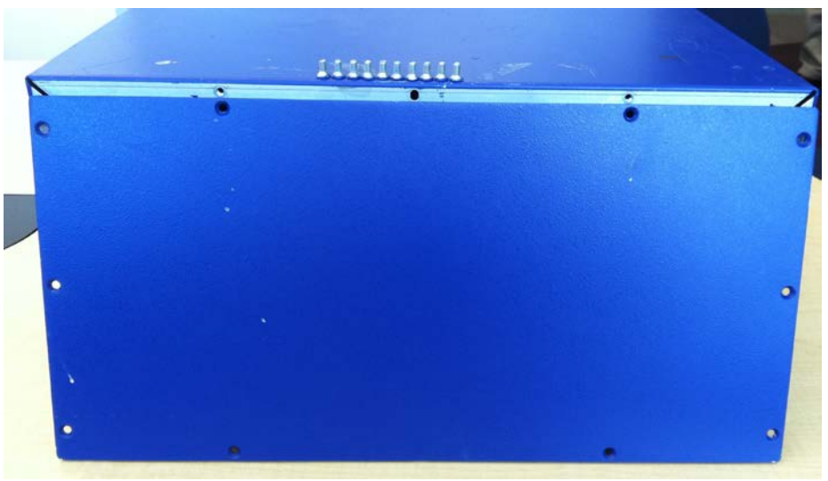
Figure 14: NetScreen-5400 with rear cover plate partially removed

Tamper Seal Placement – NS5400 (14 seals)