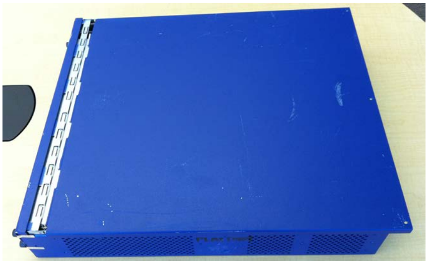
Fig. 7: NetScreen-5200 with cover partially removed

Tamper Seal Placement - NS5200 (7 seals)