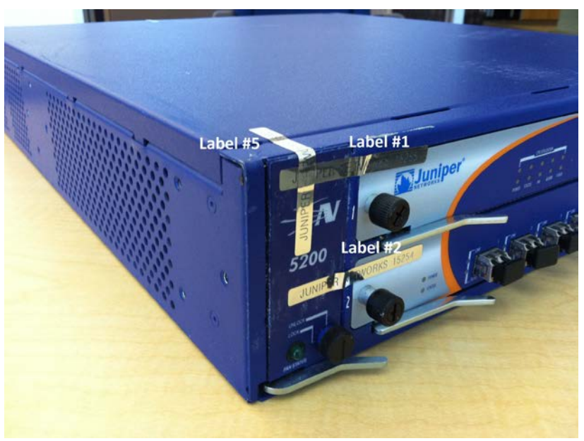
Fig. 6: Left edge of NetScreen-5200