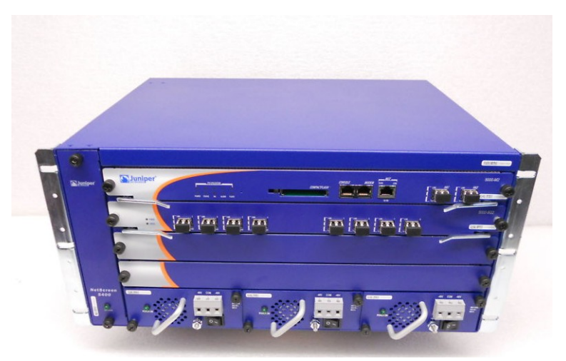
Fig. 2: NetScreen-5400