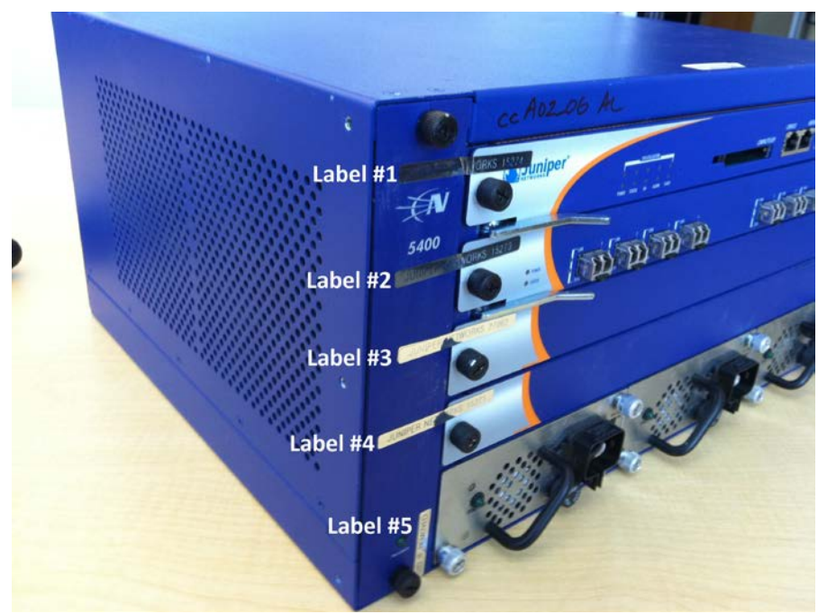
Figure 9: Left edge of the NetScreen-5400