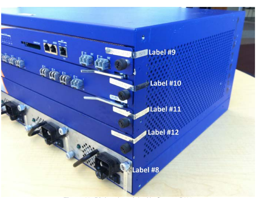
Figure 10: Right edge of the NetScreen-5400