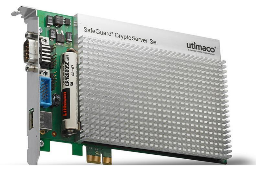
Figure 1 – SafeGuard® CryptoServer Se

For communication with a host the PCIe board offers a PCIe interface, two serial interfaces (V.24) and a USB interface.