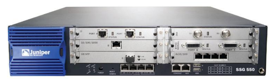
Fig. 2: SSG 550M