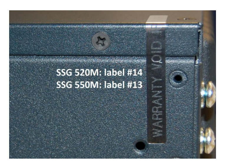
Figure 6: Rear corner of the SSG 520M and 550M

Tamper-evident seals (14 for the SSG 520M, 13 for the SSG 550M) should be applied to: