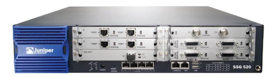
Fig. 1: SSG 520M

The entire case is defined as the cryptographic boundary of the module. The SSG 500 series physical configuration is defined as a multi-chip standalone module. The chips are production-grade quality and include standard passivation techniques. The SSG 500 series conforms to FCC part 15, class B.