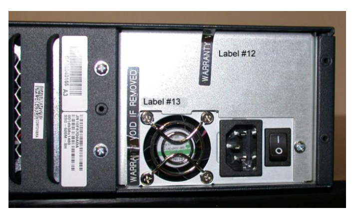
Figure 4: Rear detail of the SSG 520M