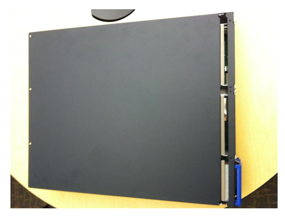
Figure 7: SSG 350M with the cover slid back

The removable cover on both the SSG520M and SSG550M is a single piece covering the top of the unit and is fastened to the chassis by multiple retaining screws. Figure 7 depicts the device with the tamper seals removed and the cover partially removed. Please note that there are no user serviceable components inside the device.