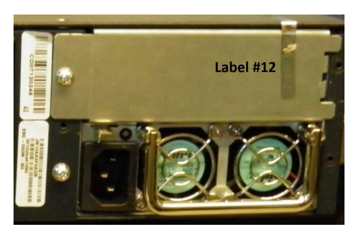
Figure 5: Rear detail of the SSG 550M device