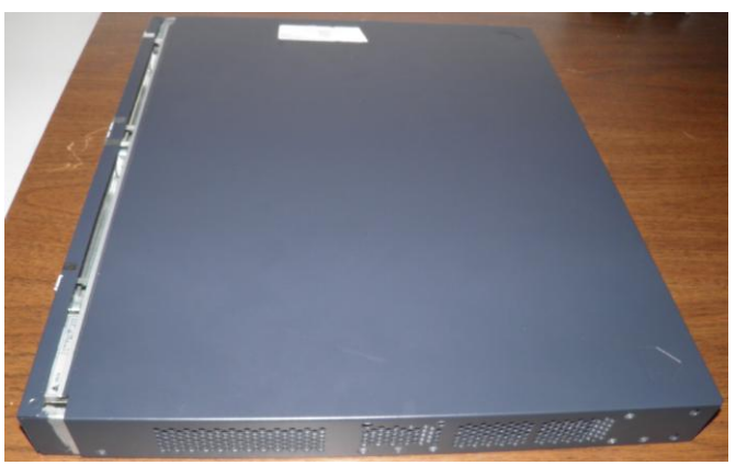
Figure 6: SSG 140 with cover slid back