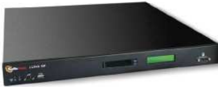
Figure 2-3. Luna SP with Luna PCI Module Installed