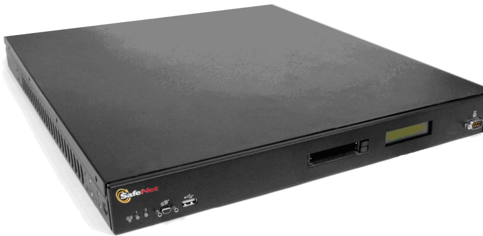
Figure 2-2. Luna SA with Luna PCI Module Installed