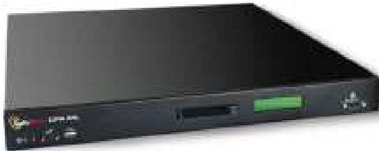
Figure 2-4. Luna XML with Luna PCI Module Installed