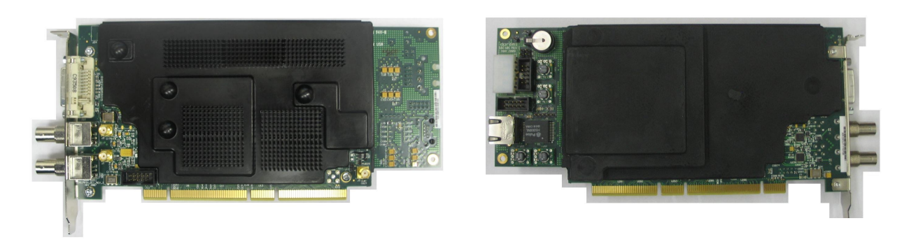
Figure 1: Hardware Model DOLPHIN-DCI-1.2-A0