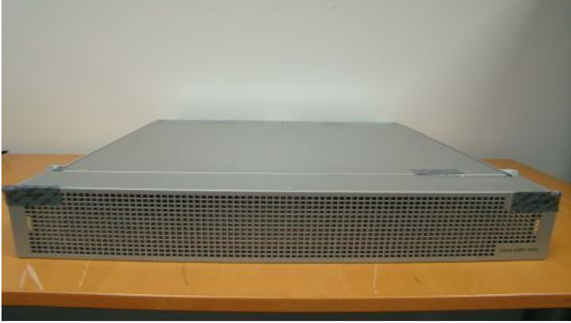
Figure 10: ASR 1002f with Opacity Shield Installed