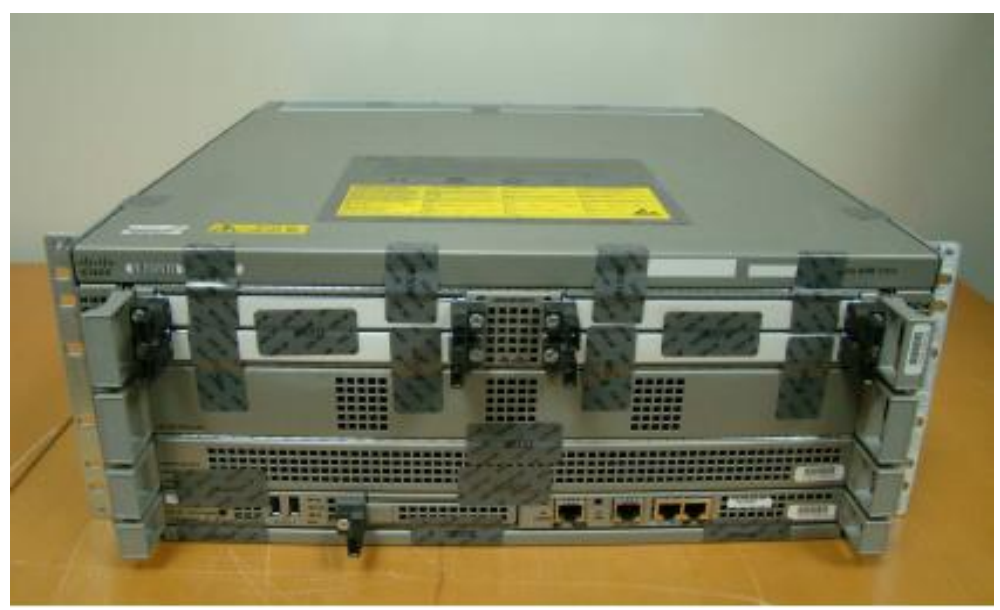
Figure 5: ASR 1004 Tamper Evident Seal Placement Front