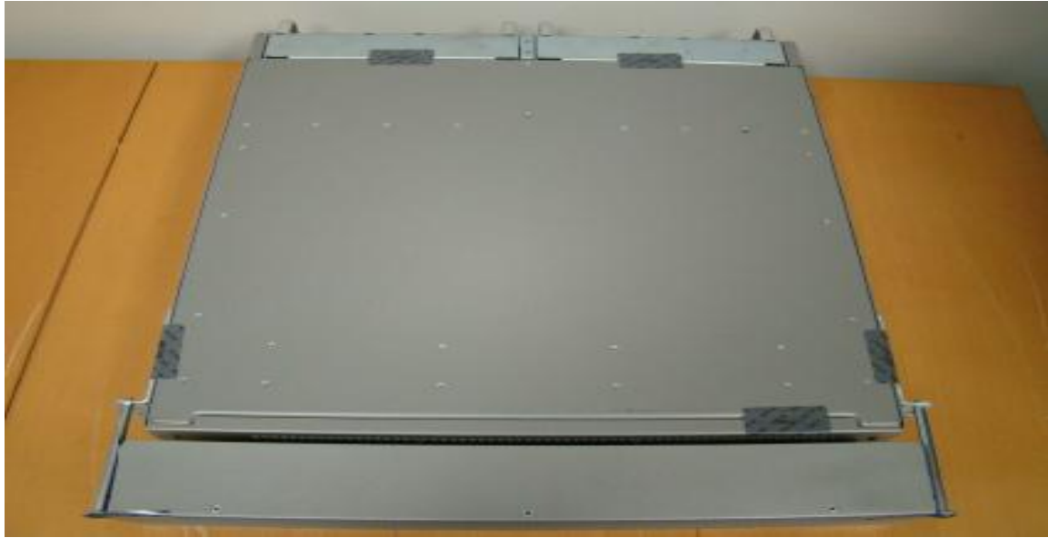
Figure 4: ASR 1002f Tamper Evident Seal Placement Top