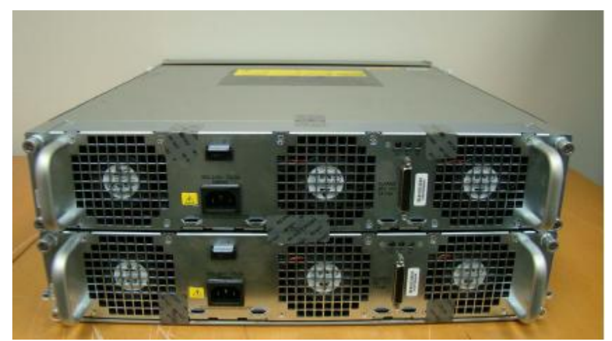
Figure 6:ASR 1004 Tamper Evident Seal Placement Back