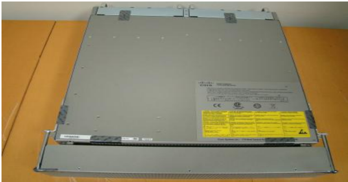
Figure 2: ASR 1002 Tamper Evident Seal Placement Top