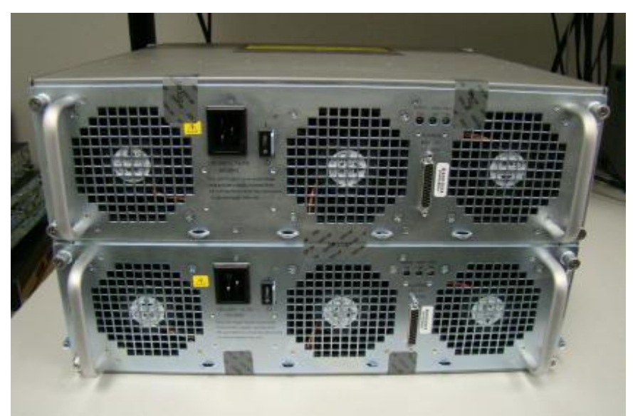
Figure 8: ASR 1006 Tamper Evident Seal Placement Back