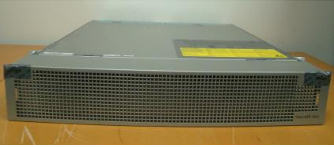
Figure 9: ASR 1002 with Opacity Shield Installed