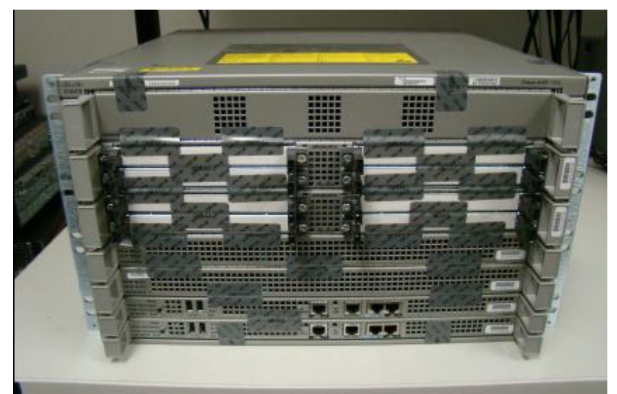
Figure 7: ASR 1006 Tamper Evident Seal Placement Front