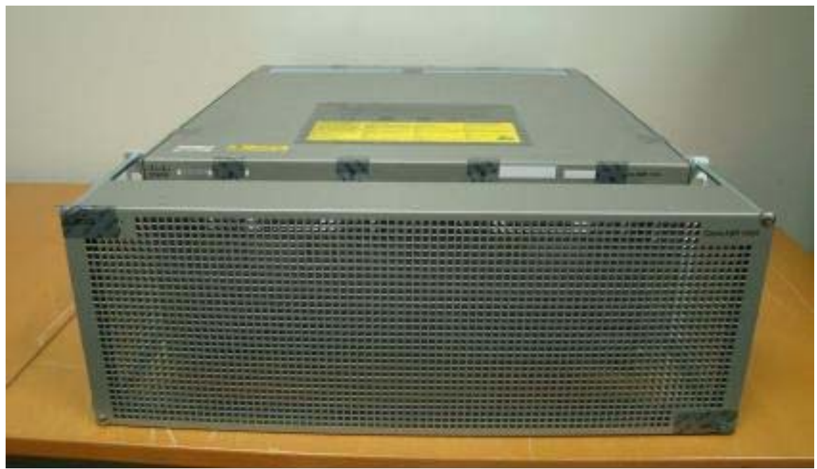
Figure 11: ASR 1004 with Opacity Shield Installed