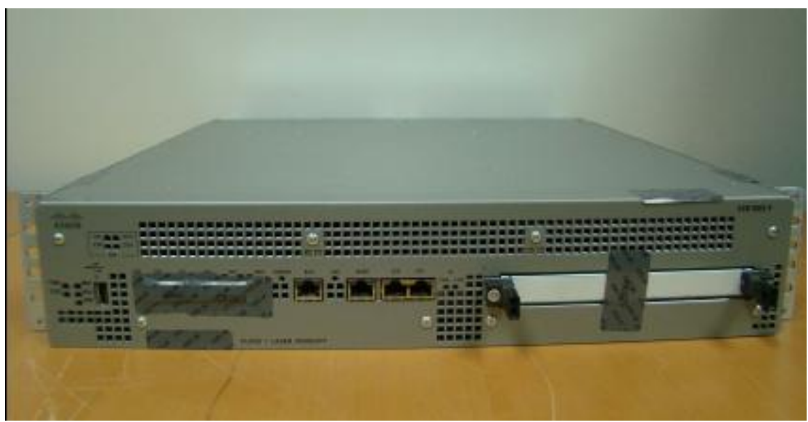
Figure 3: ASR 1002f Tamper Evident Seal Placement Front (w/o shield)