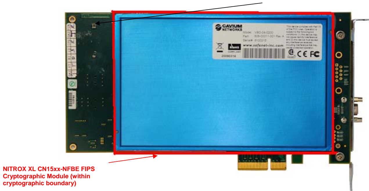
Figure 2-1. NITROX XL CN15xx-NFBE FIPS Cryptographic Module (full-form factor)

NITROX XL CN15XX-NFBE – Cryptographic Acceleration Board (RoHS6 Compliant)