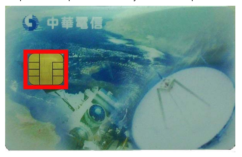
Figure 1. Physical View of the Cryptographic Module.

The HICOS PKI smart card chip module is a single chip implementation of a cryptographic module. Figure 1 shows a physical view of the module configured into a smart card. Figure 1 shows only the module contact faceplate. The chip is located directly under the faceplate within the outline shown.