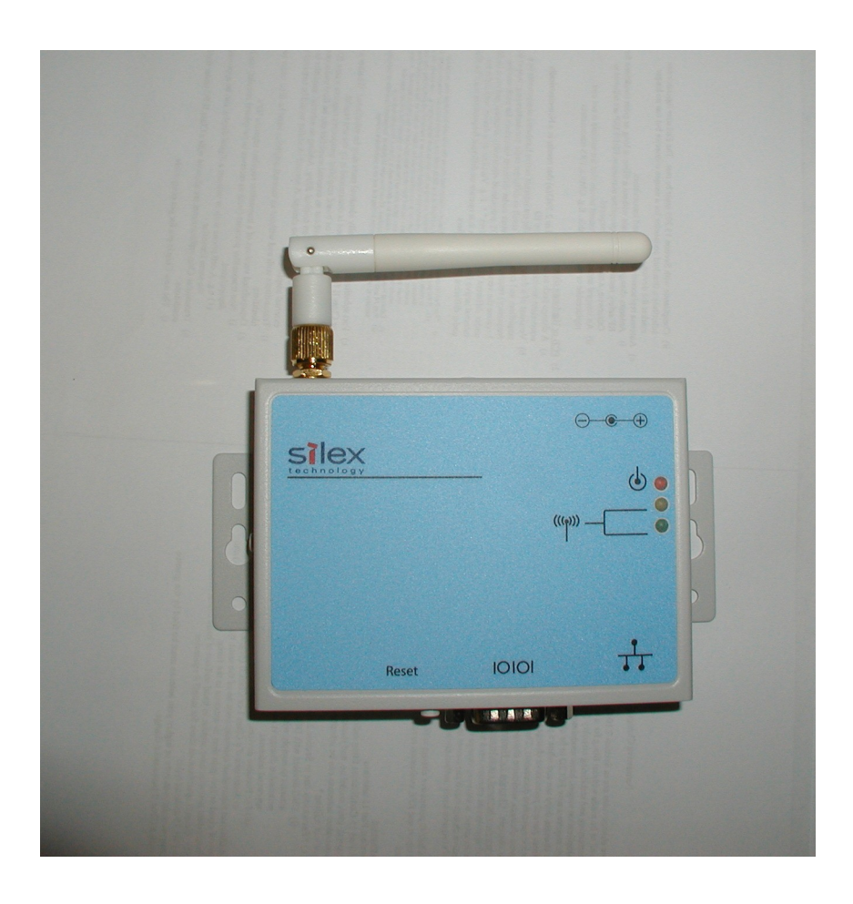
Figure 1 - SX-500 Cryptographic Module

The Cryptographic Module in the SX-500 is composed of the SX-500 hardware module and associated firmware. The cryptographic boundary of the SX-500 hardware module, STA part number 132-00188-120 rev. B or rev. C, is the physical enclosure of the assembly as shown.