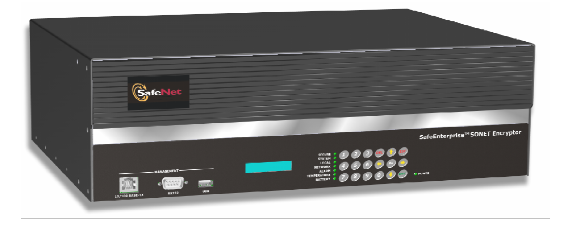
Figure 4. Model 650 Encryptor Front View.

All 650 series systems share a common enclosure. The following figure shows the front view. The front panel provides a network management port, a console port, a USB port, an LCD display and LEDs for status, and a keypad for control input. The height accommodates the dual -48V DC power supplies.