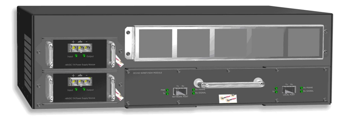
Figure 5. Model 650 Encryptor Rear View

The module has eight physical ports and four logical interfaces. The physical ports have the following functions: