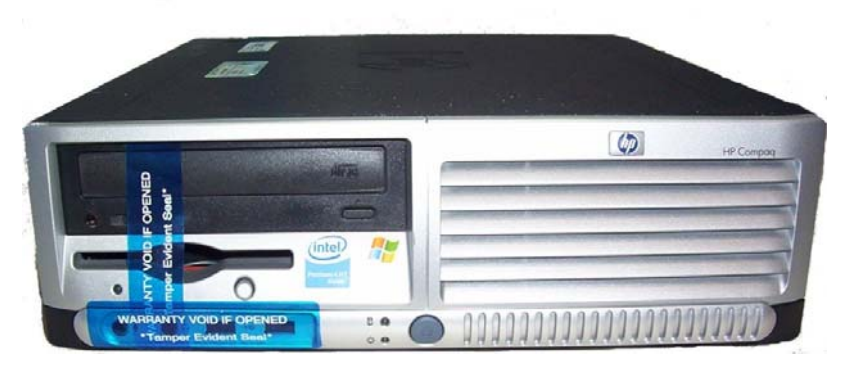
Figure 1 Front

The Module has tamper evident seals that cover all external physical ports that are installed as part of the setup and initialization procedure. The location of the seals are described below: