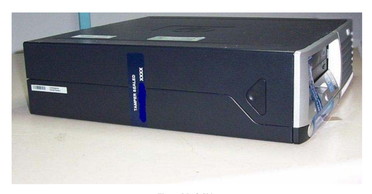
Figure 3 Left Side