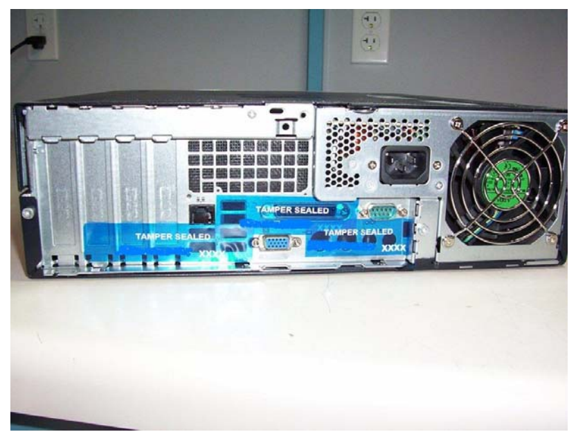
Figure 2 Back