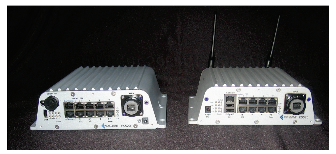
Figure 3: Front View of the ES520V2 (Left) and ES520V1 (Right) with Blue Blocker