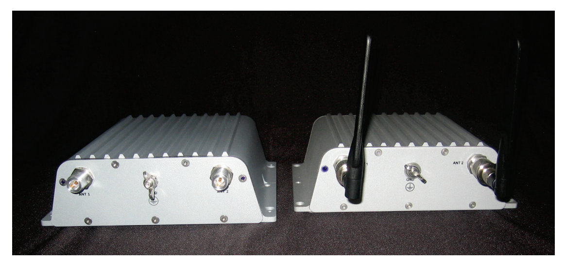
Figure 4: Back View of the ES520V2 (Left) and ES520V1 (Right) with Blue Blocker