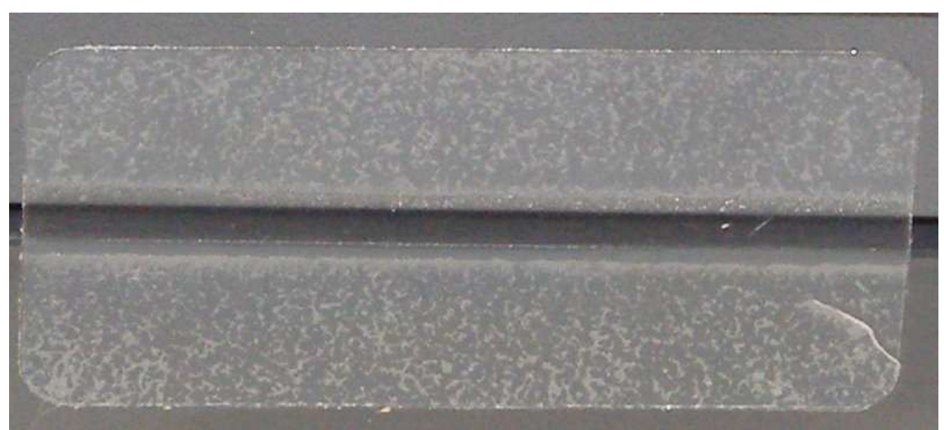
Illustration 2: Tamper Evident Label Intact

The SPAR features two tamper evident labels on either side of the case. These tamper evident labels are applied by the manufacturer prior to shipment. In order to be run in FIPS approved mode, a daily inspection of the labels is required.